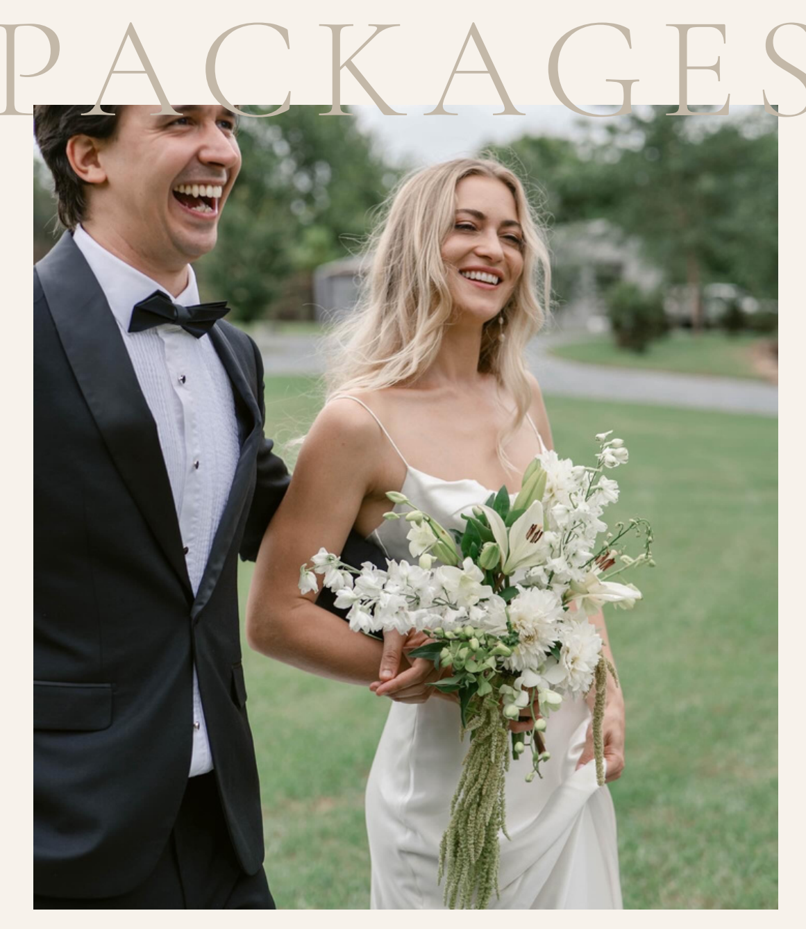
SERVICES & PRICING GUIDE